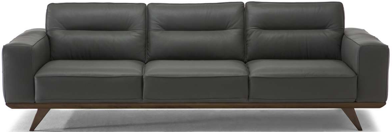
■ Vers. 064