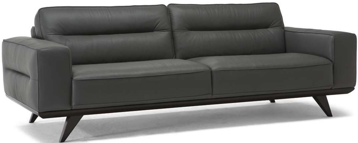
■ Vers. 009