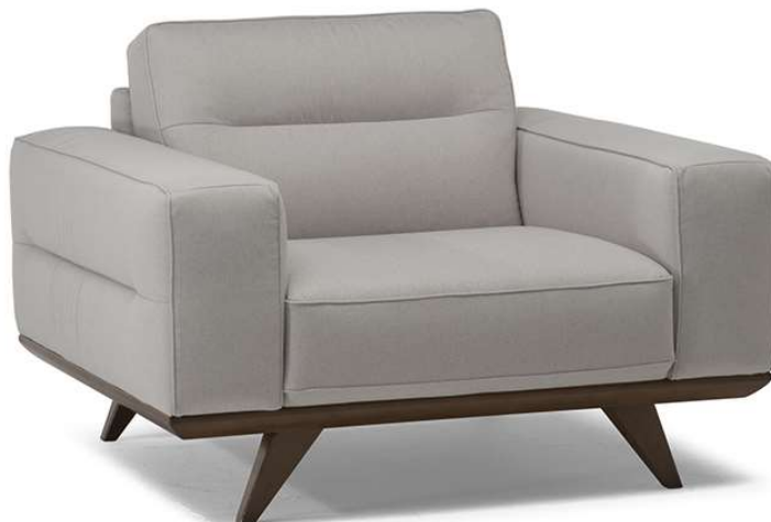
■ Vers. 048