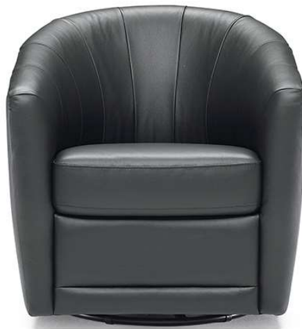
■ Vers. 066