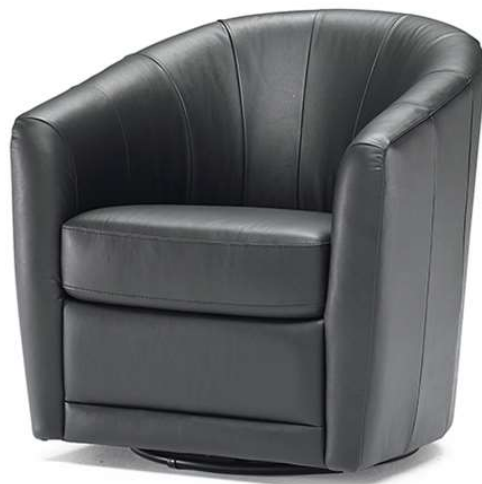
■ Vers. 066